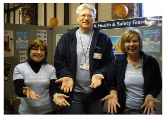
Wash your hands campaign at Chilford Hall March 2009

This Plan links to the Corporate Aims and Approaches and also the service objectives which are provided in the Health and Environmental Services Plan